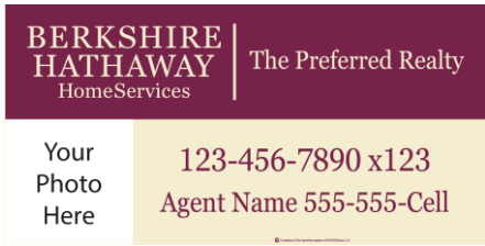
Magnetic Layout A