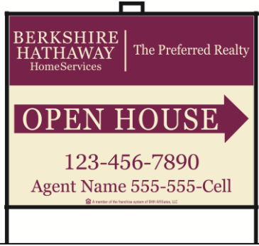
BLACK METAL TENT SIGNS $64/ea + tax