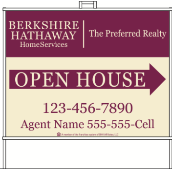
EZ-CARRY A-FRAMES $54/ea + tax