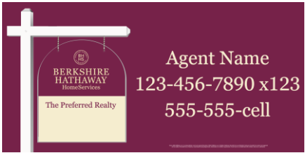
Magnetic Layout B